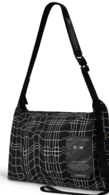
"Erlkönig" prototype cars and the art of deception (bmw.com)